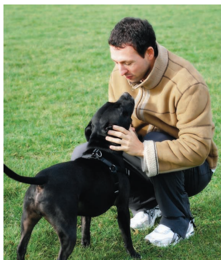
Eager to please. Dogs, like human infants, are specially adapted for following instructions from humans.

The original experimental task suggesting unusual social-cognitive skills in dogs was a communication task (2, 3). If a piece of food is hidden in one of several opaque cups, and then a human points to the cup containing the food, a dog can infer the location of the hidden food quite readily. To comprehend the pointing gesture in this context, a dog must infer something about why the human is directing its attention to a boring cup—why the human's communicative gesture is relevant to their search for the food. Dogs' skills in this task are surprising because, as simple as it seems for humans [human infants solve it at around the first birthday (4)], even our nearest primate relatives, the great apes, fail at it miserably (5), as do wolves (5, 6). Dogs have not shown special cognitive skills relative to other mammals in nonsocial cognitive tasks, such as understanding space or physi-